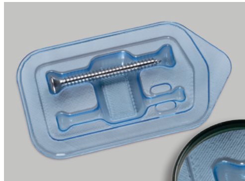
Rapid prototyping Blister Delivery time: 2 – 3 days

Due to the modern technology, the costs of manufacturing for such prototypes are in a low range. Please do not hesitate and ask for your personal offer.